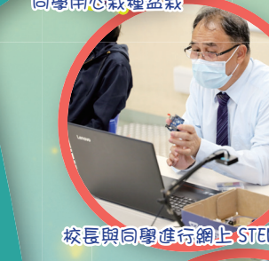
校長與同學進行網上 STEM 班